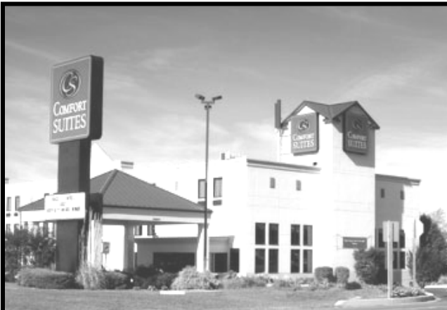
Retreat Accommodations at Comfort Suites 1801 Dual Highway, Hagerstown

All retreat participants are asked to bring a "New Revised" or "Revised Standard" Bible if possible.